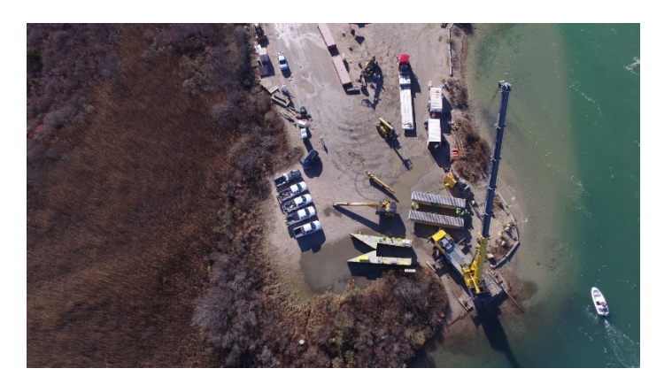
Figure 8 Project mobilization