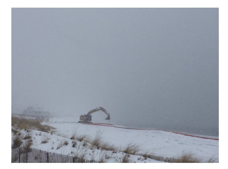
Figure 3 Winter working conditions