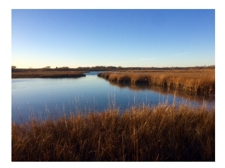
Figure 7 Healthy Marsh