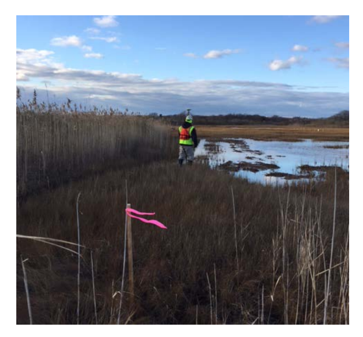
Figure 10 Survey of the boundary between healthy and dead marsh