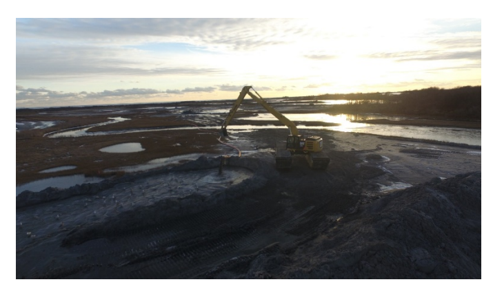
Figure 4 Discharge control in the designated marsh area