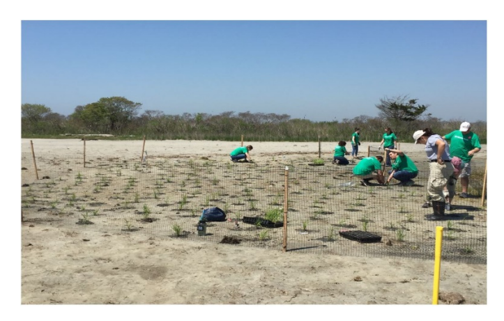
Figure 6 Project Planting