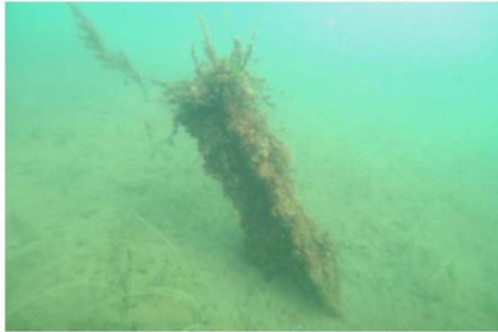
Photo 3 - steel rail, 27 in. vertical.

(Figure 4) that were large enough to hinder cap placement and function, and thus warranting removal. The contractor was required to remove these additional debris features under a change order.