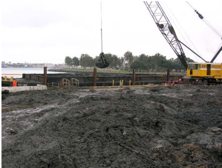
Figure 10. Offloading dredged sediment from barge into stockpiling area.

As was discussed previously, the Otay Landfill in Chula Vista accepted site sediment for disposal, provided that it was sufficiently dewatered to pass the “paint filter” test. Sediments were typically stockpiled within this area for a time period of 2 to 5 days, during which time it was regularly reworked using a rubber-tired front end loader to facilitate air-drying (Figure 11). This physical drying technique ended up being sufficient, as the landfill accepted all truck loads of material. As a result it was not necessary for the contractor to add any dewatering additives to the sediment.