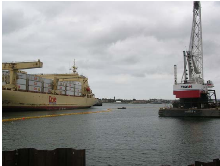
Figure 13. Dredging operations and silt curtains adjacent to TAMT (with Dole vessel in berth).

Communication and construction activities were facilitated by the TAMT’s agreement with the Port to use line hauling, rather than tug boats, to pull vessels into Berth 10-1 for a 4-month period, corresponding to dredging and capping activities. This arrangement was worked out prior to construction as a way of improving the project’s overall constructability.