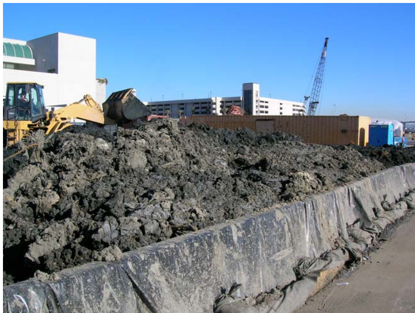
Figure 11. Rehandling within sediment stockpiling and dewatering area.

As was discussed previously, the Otay Landfill in Chula Vista accepted site sediment for disposal, provided that it was sufficiently dewatered to pass the “paint filter” test. Sediments were typically stockpiled within this area for a time period of 2 to 5 days, during which time it was regularly reworked using a rubber-tired front end loader to facilitate air-drying (Figure 11). This physical drying technique ended up being sufficient, as the landfill accepted all truck loads of material. As a result it was not necessary for the contractor to add any dewatering additives to the sediment.