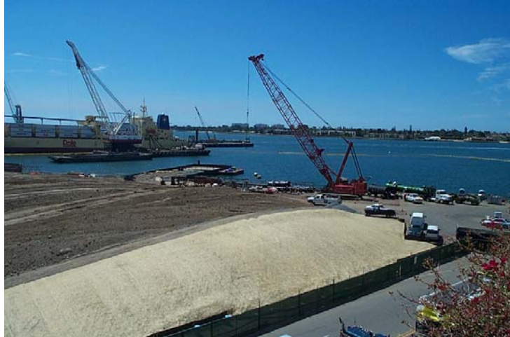
Figure 14. Campbell Shipyard Construction site and adjacent earthwork area for Hilton development (photo taken from top of Convention Center).