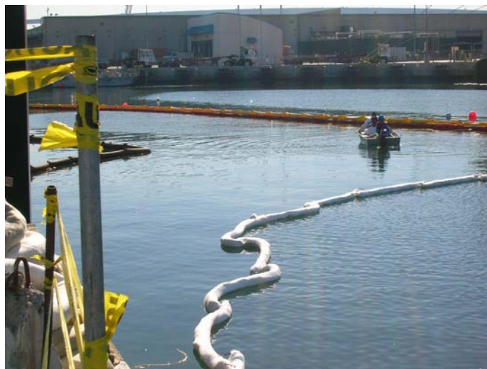
Figure 13. Oil boom deployment (near field) and silt curtains (far field).