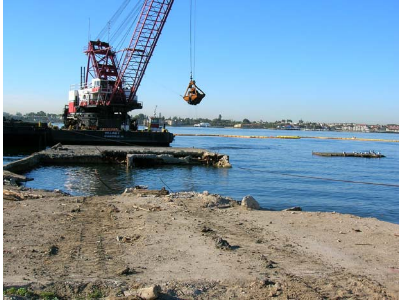
Figure 2. Demolition and debris removal underway (note partially excavated mole pier in foreground).