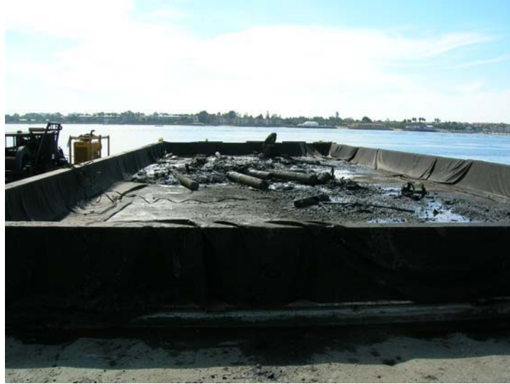
Figure 8. Barge being loaded with sediment and debris.

The barges had been equipped by the contractor with enclosures constructed with K-rail barriers (Figure 8). Sediment was permitted to drain from the barge directly into the Bay, through filter fabric-lined gaps under the rails, provided that water quality criteria were met at all times. To date, no water quality violations have been recorded (see section on Environmental Protection).