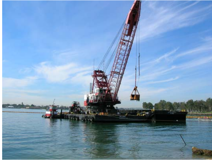
Figure 6. Dredging equipment in action.

Sediment was dredged using a toothed clamshell bucket and loaded directly onto flat-deck barges (Figure 6). Daily dredging rates were typically on the order of 153 to 229 cubic meters (200 to 300 cubic yards) per day, although the production rate increased to as much as 765 cubic meters (1,000 cubic yards) per day while dredging the area closest to TAMT, where the cut thickness was greatest (over 3.3 meter (10 feet)).