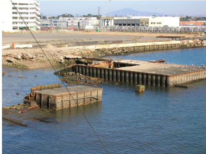
Figure 1. Condition of shipways area and mole pier following free product removal.

The sediment project team considered the option of fully removing the mole pier, but ultimately decided against that option as it would have resulted in additional demolition and disposal costs, and would still require construction of some sort of protective barrier for the eelgrass habitat area in its place. Therefore, the design was modified to include reconstruction of the mole pier to its originally planned dimensions. This activity is discussed briefly later in the paper.