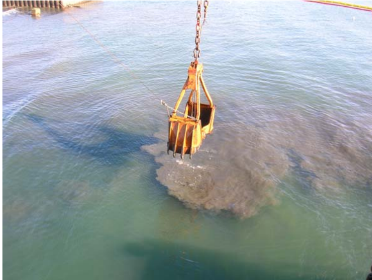
Figure 12. Typical example of turbidity generated during dredging and debris removal operations. Portion of perimeter silt curtains are visible in upper right corner of photograph.

In some cases early on during demolition and debris removal from along the seawall, minor amounts of sheen and potential product were noted on the water surface. In these cases, the contractor immediately informed the Port, and an environmental cleanup subcontractor was called out to the site to contain and remove the product and sheen. Skimmer pumps and absorbent pads were used for removal of visible sheen, with an oil absorbent boom in place for spill containment (Figure 13).