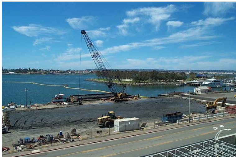
Figure 9. Sediments being loaded from flat-deck barge into stockpiling area.

The Contractor established a sediment stockpiling and dewatering area over an approximately 0.6 hectare (1.5 acre) area on the adjacent project uplands (Figure 9). This area was lined and surrounded on three sides by K-rail barriers. Recently filled barges pulled up alongside this area and offloaded using a land-based crane, into the stockpiling and dewatering area (Figure 10). A spill apron was constructed at the offloading point to protect Bay waters from sediment that may drop off during transfer.