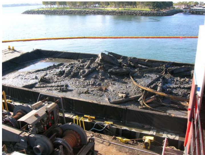
Figure 3. Barge load of debris shows accompanying sediment.

During this process, a significant amount of accompanying sediment was brought up with the debris (Figure 3). In some cases, the amount of accompanying sediment exceeded (by as much as a factor of two) the tonnage of the demolition debris itself.