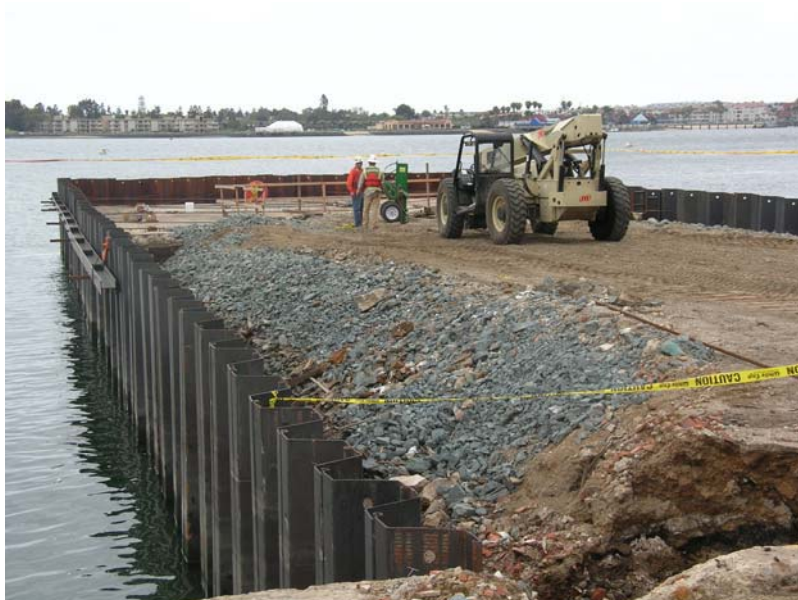
Figure 5. Mole Pier reconstruction underway.

As mentioned previously, the mole pier needed to be reconstructed since much of it had been removed during the hazardous waste removal operations. Figure 5 shows the new sheet piling installed around the mole pier's perimeter, and the rock fill that was used to backfill the areas that had been excavated earlier for free product removal.