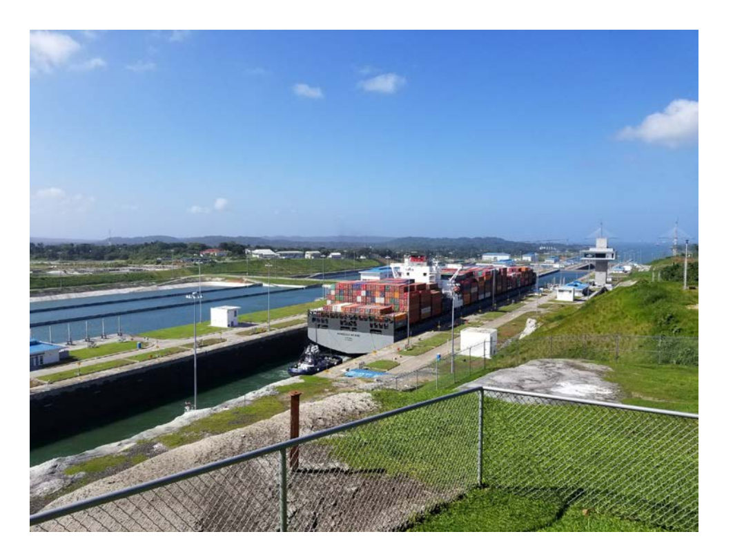
Photo of Panama Canal