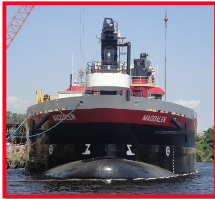
Fall 2017, $110M – Magdalen