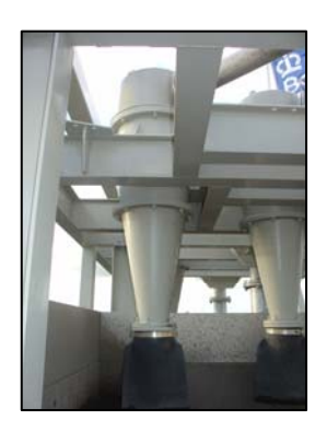
Figure 9. Hydrocyclones for sand separation.

The hydro-cyclones (sand separators-Figure 9) are specially constructed for maximum recovery of sand fraction and separation of mineral materials. The separators are rubber lined to reduce wear and tear. The geometry of the separators is designed to handle high solid concentration.