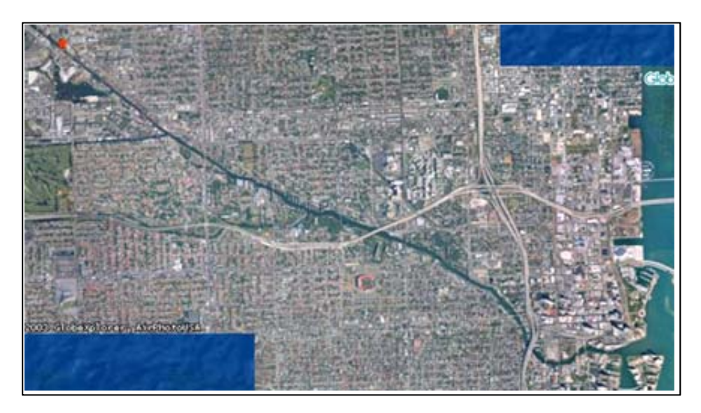
Figure 2. Aerial map of Miami River.

Dredged Material Transport Method Selection: Barge Transport (Tug and Barge) vs. Hydraulic Transport (Pumping)