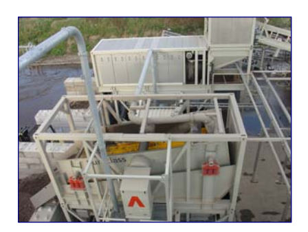
Figure 5. Screening stage equipment.

The dredged sediment is loaded into the plant by using a hydraulic excavator.