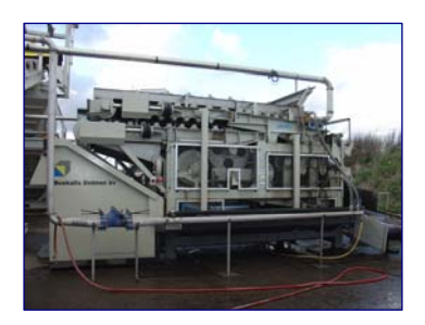
Figure 11. Belt presses.

The pre-thickened fines are pumped to belt filter presses. Belt filter press capacity and filter cake solid/moisture content depends on sediment characteristics. For Miami River, the cake solid content is typically between 45 to 50%. The resulting filter cake is stockpiled with a conveyor belt for transport to landfill disposal. Filtrate from the gravity and pressure sections of the belt filter presses is pumped to the water treatment section of the plant.