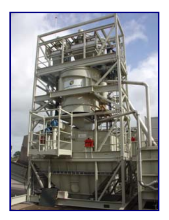
Figure 7. Shaker screen.

The material that passes the trommel is pumped onto a shaker screen (Figure 7) for separation of medium size material. The material is washed with process water provided by nozzles on the screen deck. The remaining small material is collected in the second slurry tank underneath the shaker screen. The separated debris is temporarily stockpiled on the Dockside facility until it can be transported for disposal.