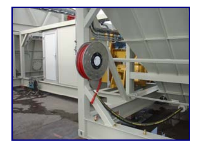
Figure 15. Spare parts container.

To minimize plant down-time the plant is equipped with a spare parts container (Figure 15). In this container most spare parts are stored. The plant superintendent is keeping spare part storage up-to-date and is responsible for sufficient spare parts. The plant is also equipped with a workshop container. This container is equipped with the most important tools. The mobile plant is controlled by a computer. A list of production hours and maintenance intervals of the plant components are automatically produced. Preventive maintenance is scheduled accordingly.