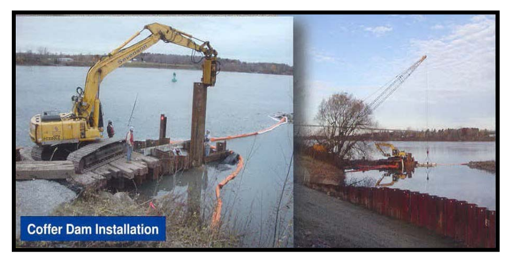
Figure 2. Examples of engineered controls - coffer dam & sheet pile (Francingues 2005).

In order to properly select silt curtains or silt screens, several key questions should be asked by the project designer of the dredging project.