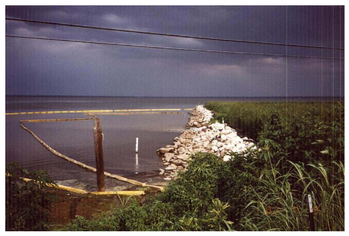
Figure 3. Dual curtain installation at Lake Palourde fill site.

Silt curtains used in New Orleans District projects are designed as permeable curtains that are buoyed at the top and anchored at the bottom. The overall height of the curtain is designed to be 1.33 times the water depth in which the curtain is deployed. That is, 2/3 of the skirt is equal to the water depth and an additional 1/3 of the water depth is added to the skirt. The curtain performed as anticipated and met the project requirements; however, water quality monitoring was not required nor conducted. Details on the materials and installation including the cost of the silt curtains were not available from New Orleans District Personnel.