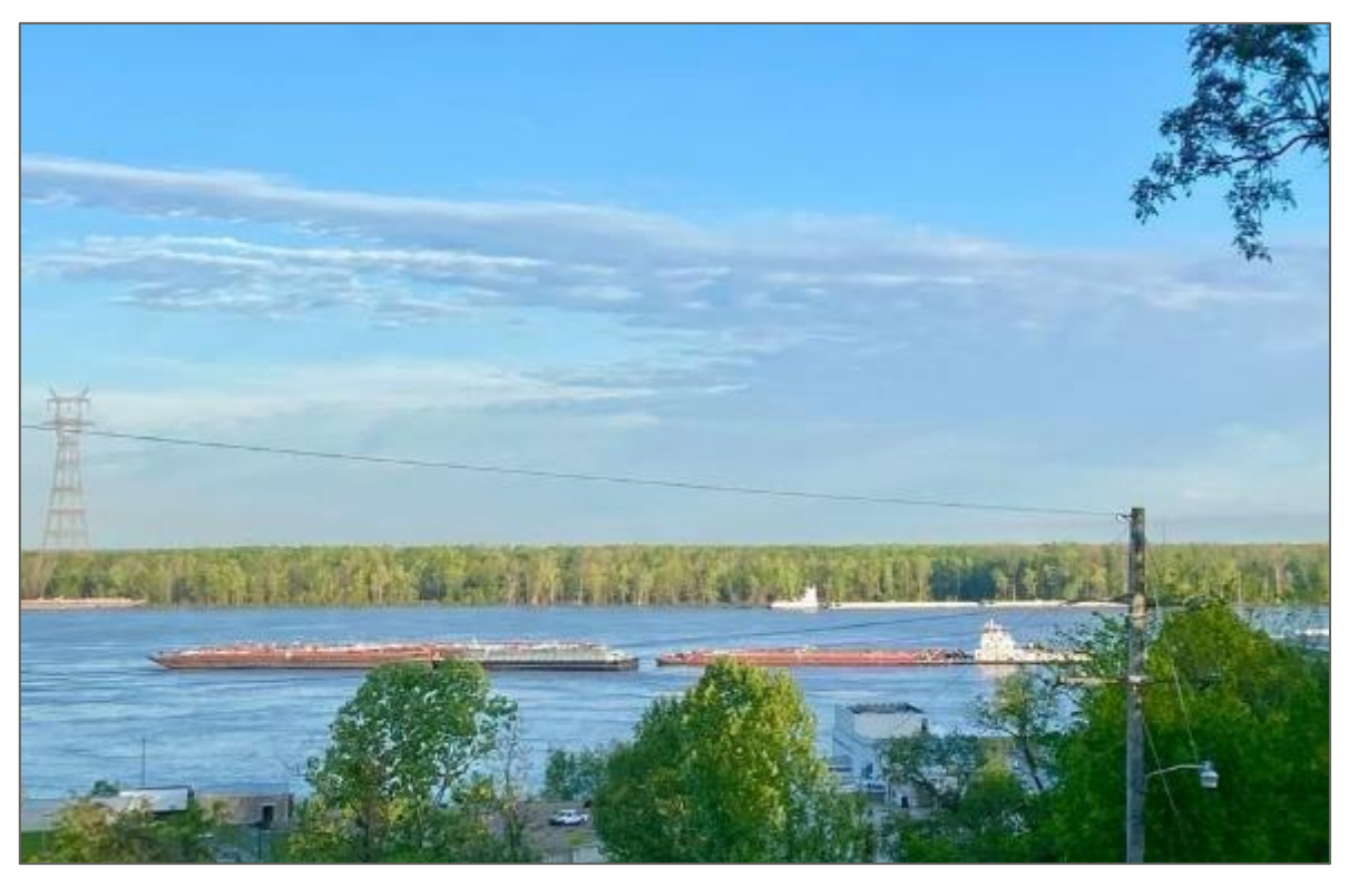
Barges on the Mississippi River, Vicksburg MS