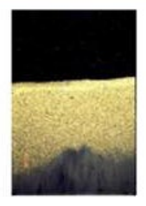
Thin-Layer Placement for Bottom Contouring