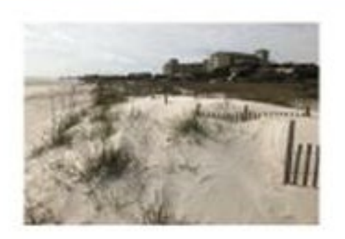
Beach and Dune Construction