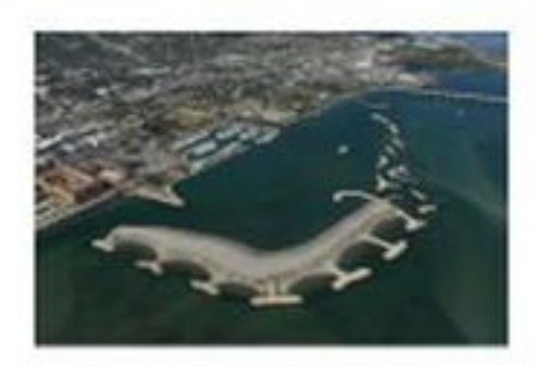
New Island Construction

US Army Corps of Engineers • Engineer Research and Development Center