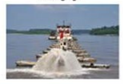
Sediment "Recharge" via Dredging