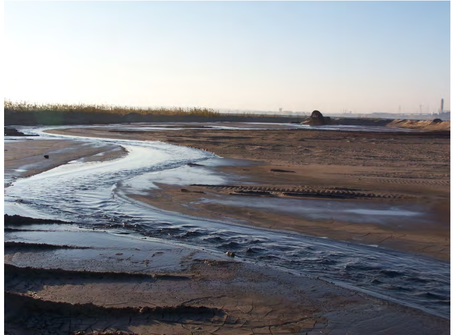
Views of effluent stream created by deposition