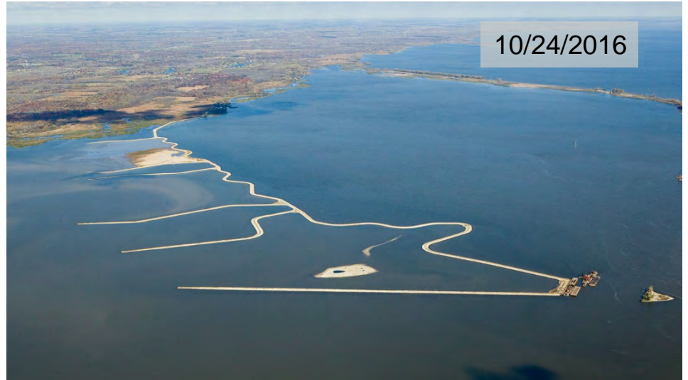
10/24/2016 Presence of minor localized turbidity. As stated in Environmental Assessment, considered minimal and temporary disturbance typically less in magnitude than a storm event