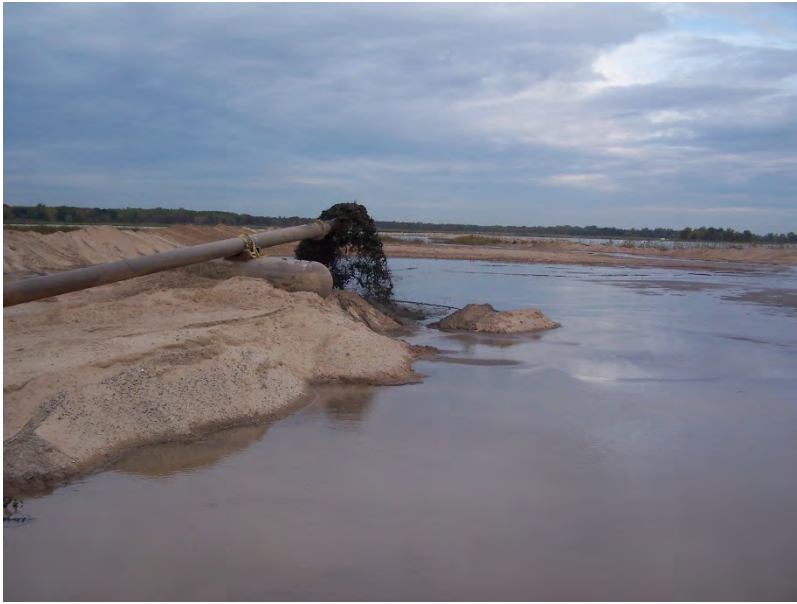
Hydraulic Pipeline W/ Baffle Plate discharging at sump area