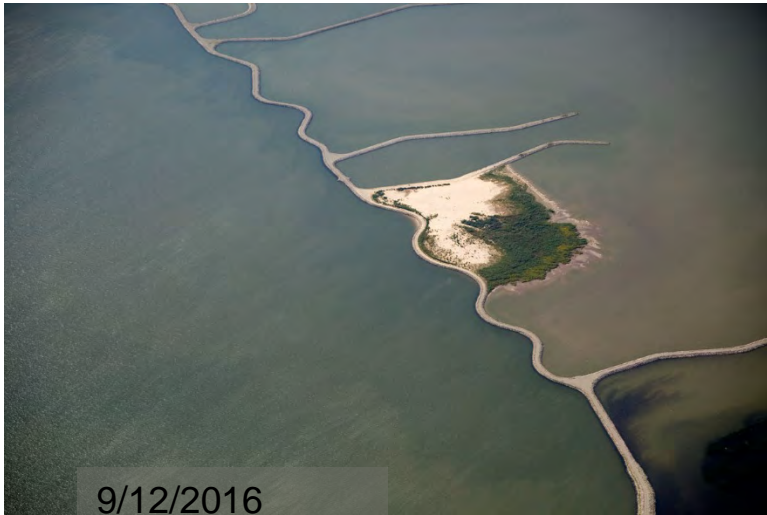
9/12/2016 Before placement