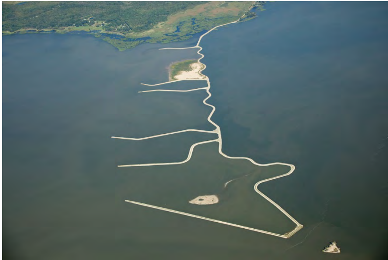
9/12/2016 Before placement