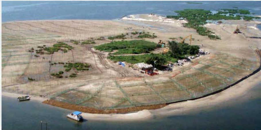
Completing Elders East (2006)