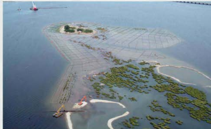
Starting Elders West (2009)