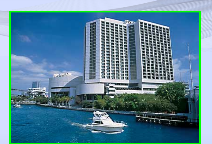
HYATT REGENCY MIAMI