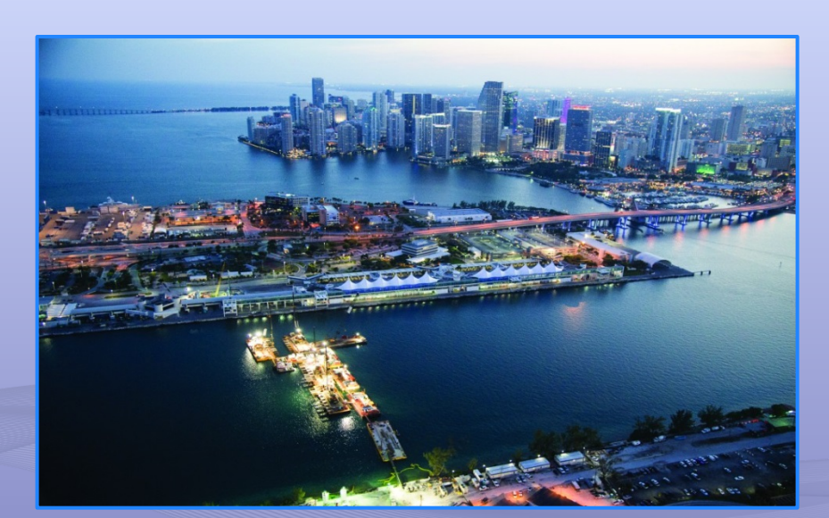
Dredging Creates a Strong Economy and a Cleaner Environment