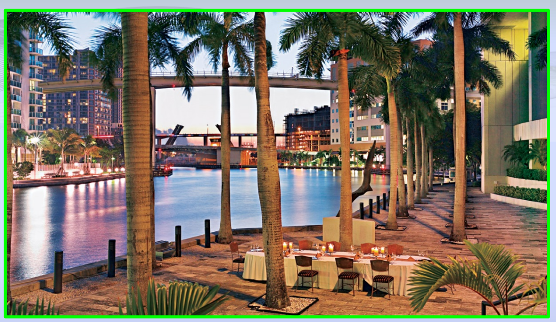
OUTSIDE EXHIBITORS HALL